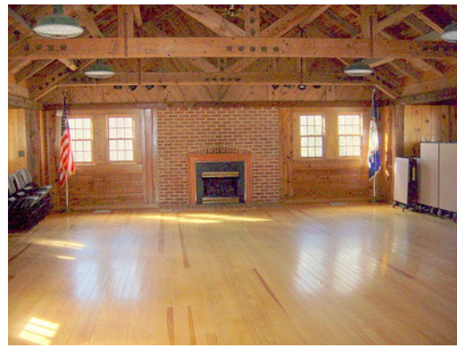
The interior (west end) of Swift Creek Banquet Hall.

Pocahontas State Park 10301 State Park Road Chesterfield, Virginia 23832 804-796-4255