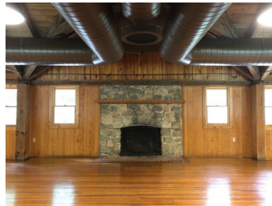
Fireplace inside of Powhatan Banquet Hall.

The capacity of the Swift Creek Banquet Hall is 150. The capacity of the Powhatan Banquet Hall is 125.