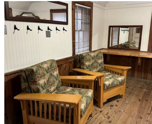
Inside Bride Cabin (Powhatan Only).