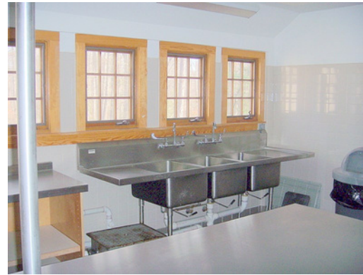
Kitchen – Swift Creek Banquet Hall. Industrial size kitchen appliances are included.