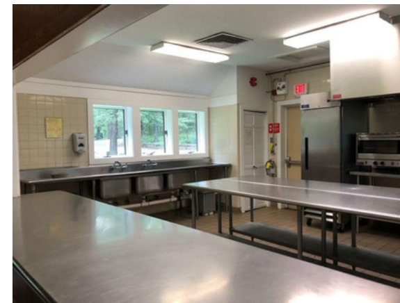
Kitchen view of Powhatan Banquet Hall.