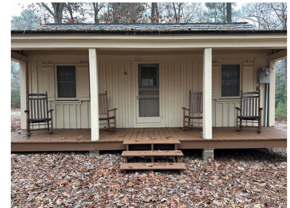
Outside Bride Cabin (Powhatan Only).