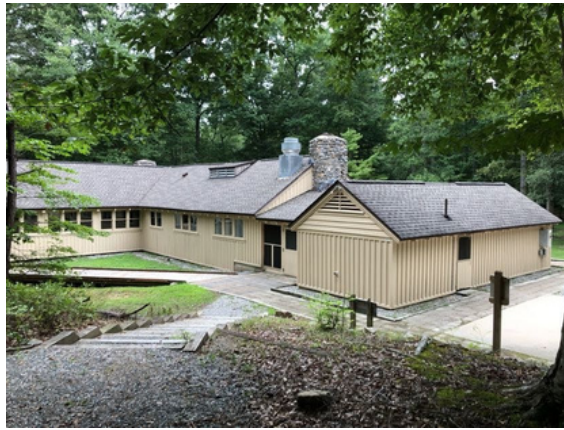
Backside of Powhatan Banquet Hall.