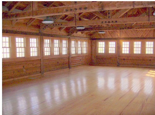
The interior (east end) of Swift Creek Banquet Hall.